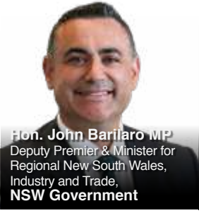
Hon. John Barilaro MP Deputy Premier & Minister for Regional New South Wales, Industry and Trade, NSW Government